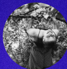
Laila New Zealand