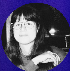
Zoé France Production